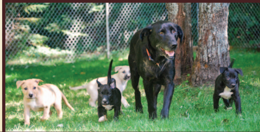
Cleo with four of the six orphans: Jitterbug, Tango, Disco, and Foxy at their foster home (all puppies have been adopted).

This is just one story of many showing how our programs and services help companion animals across PEI. Will you open your heart by making a donation to the Island's only Shelter for lost, abused, and homeless companion animals so we can continue to help make happy endings?